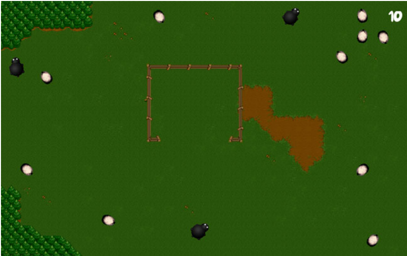
Fig. 2. Screenshot of Mind the Sheep! with three black dogs and ten white sheep. The pen is located in the center.

The dogs use a simple A* search based path finding algorithm to move to a specific location on the map. By default, sheep will walk around and graze randomly. However, when a dog approaches, they will tend to flock and move away from the dog allowing them to be herded in a desired direction. The flocking behavior is introduced by using the boids algorithm [22]. By positioning the dogs at strategic locations on the map a flock of sheep can be directed into the pen.