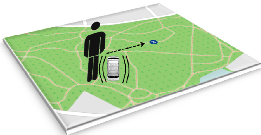
Fig. 1. A "tactile compass" encodes in which direction and how far a place is located from the perspective of the user by vibration patterns generated with a common mobile phone. Unlike wide-spread turn-by-turn wayfinding systems, this tactile compass allows a more traditional sense of navigation, empowering people to revive their inherent navigation skills.

According to a study by Madden and Rainie [11] one in six adults report to have physically bumped into another person because they were distracted using their phone. The "iPod Zombie Trance", i.e. listening to loud audio content via headphone, may result into a dangerous loss of situational awareness. Australian authorities believe that this loss is responsible for the still increasing number of pedestrian fatalities 1 . Beyond safety considerations, having to repeatedly looking at a tiny display to stay oriented is a stark contrast to the experience of a good hike. Auditory displays may be overheard when there is too much noise, or they may interrupt other actions, such as enjoying the hike or a chatting with a co-traveller.