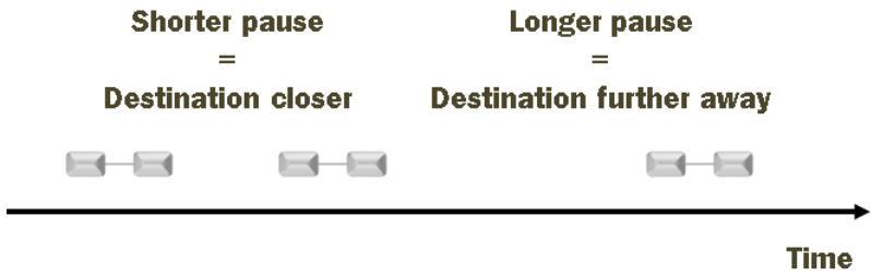
Fig. 3. The distance is encoded in the pause between a set of pulses. The shorter the pause becomes the closer the user is to the presented location.