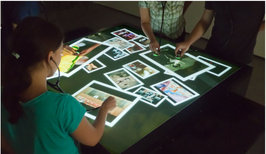
Fig. 2. Multiple users accessing individual auditory content

Multi-User Applications. The described applications easily scale with multiple simultaneous users. Each user is then presented his/her private audio channel depending on the position of his/her stethoscope head identified by his/her own unique visual marker (Fig. 2). Users can listen in to other users' content easily by placing the head of their stethoscope next to that of another user.