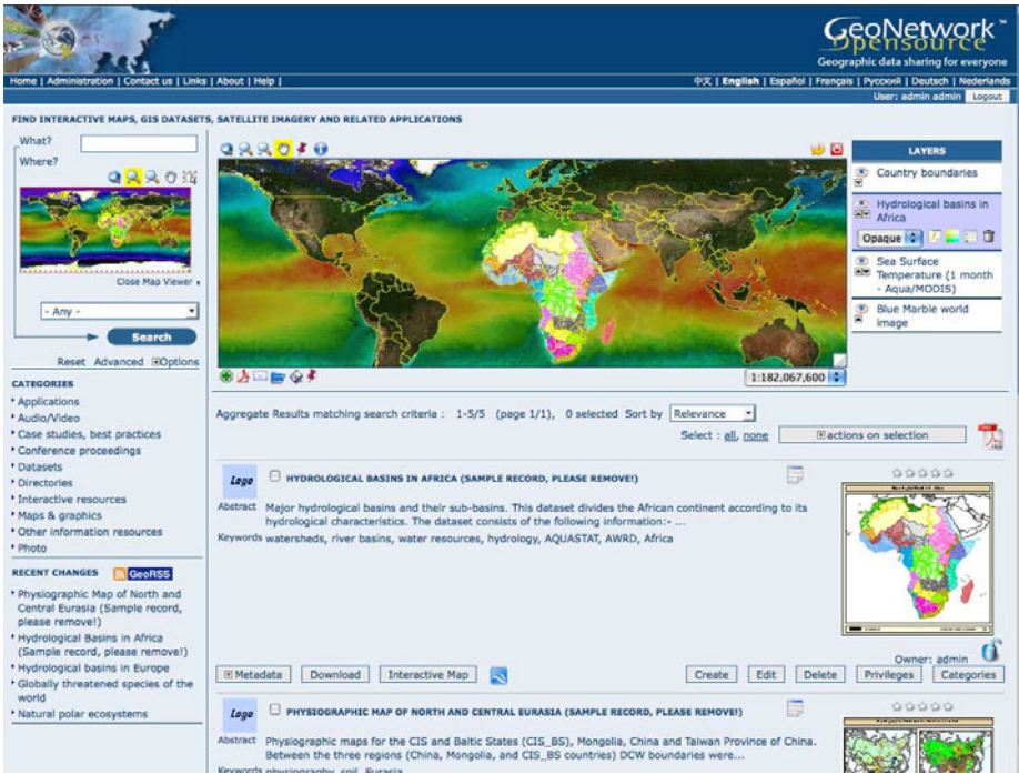
Fig. 1. Start-up page of GeoNetwork OpenSource with map-viewer and hit list

environmental projects of national and international governmental and non-governmental organisations worldwide. Figure 1 shows the start-up page of a fresh GNOS installation.