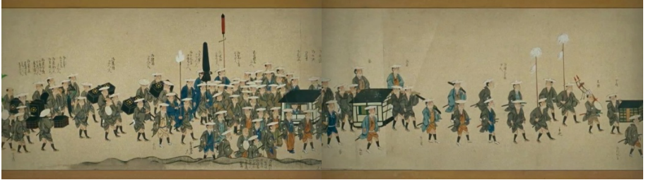
Fig. 5. Old scroll of Kumamoto Castle

library which displays graphical contents on the screens and handles user's inputs like position, direction, joystick values, etc. [7]. The final animation is displayed on 300 inch screen using 4K resolution Sony® projectors. The recording part configuration of video avatar system and the video avatar on the animation are shown in (figure 4).