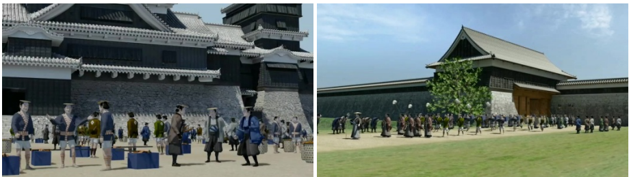
Fig. 7. Character animation of crowd (left) and ceremony (right)

We made the animation of crowd and ceremony of old ages of Kumamoto Castle in Japan. It is restored using old scroll which contains various people and snapshots of ceremony. The scroll is shown in (figure 5). We make the 3D model of castle using texture from real image of it. The 3D characters are created with referencing to other exhibits like clothes, knives, hats, bags, etc.