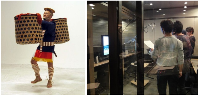
Fig. 8. Recording motion data and voice dubbing

We get motion capture data from the actors to animate characters. The snapshot of the actor in motion is shown in the left image of (figure 8). The voices of characters are dubbed by the professional voice actors and the special sound effect is added for feeling the mood of crowded environment. Voice actors are dubbing the animation like the right image of (figure 8).