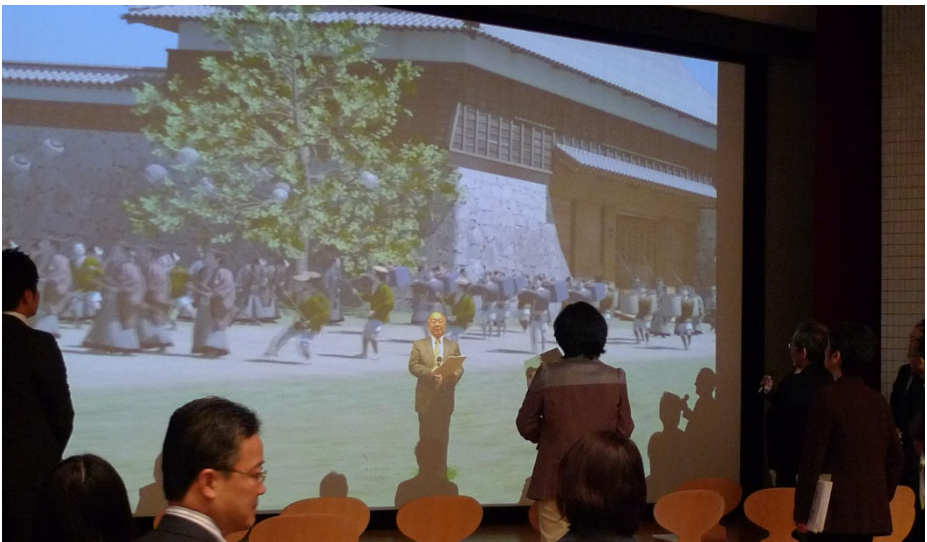
Fig. 1. Demonstration of digital museum

In this research, we restore an animation of the exhibit's age from the old scroll. Then this animation is projected onto a huge screen for viewers to feel immersion. The video avatar is added on this animation for interactivity. The demonstration of whole system is shown in (Figure 1). The animation is restored using described images on the scrolls for viewer to feel the ambience of its age.