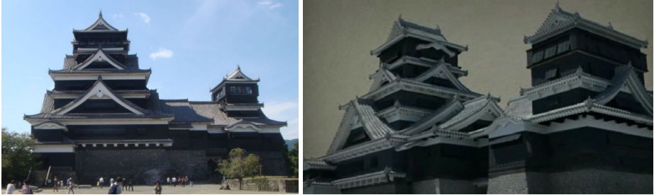
Fig. 3. Photograph (left) and model (right) of Kumamoto castle

First, 2D scraps of contour of people of the old scroll are placed. Then we replace them with the 3D characters and animate them. We get motion capture data from the actors for character animation. The voices of characters are dubbed by the professional voice actors and the special sound effect is added for feeling the mood of crowded environment.