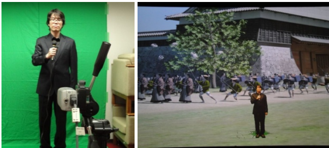
Fig. 4. Send and receive part of video avatar

We use Sony® digital camera for capturing the expert and its resolution is 800 x 600 pixels. Chroma key technique is used for background removal. The each difference of color values in RGB color space is summed up and the alpha value for pixels is determined by threshold. The expert's video avatar is superimposed on the animation on the screen.