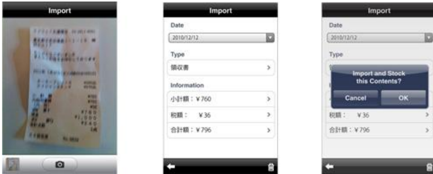
Fig. 4. Screen Image of Application for Applicant

Applicants can use the application with smart phone. And they can take a picture of till receipt and input automatically with OCR function. Approver can user widget of the Application and can operate of check things easily.