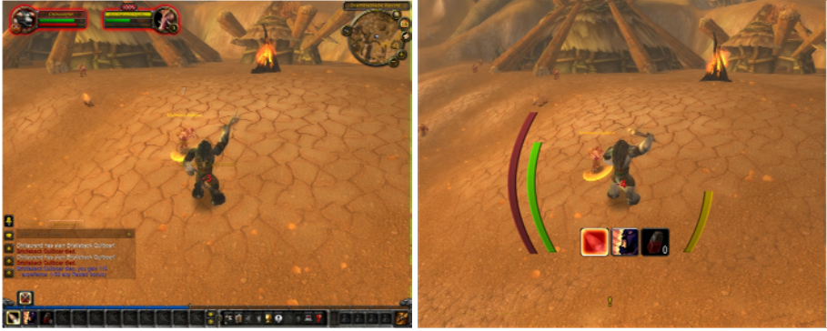
Fig. 3. The default combat UI (left) and our enhanced combat UI (right)

To focus the user's attention toward their avatar, in our enhanced combat UI, we removed empty slots from the action bar, increased the size of the ability icons by 100% (placing them under the avatar) and created arced health and resource bars around the avatar (see Fig. 3).