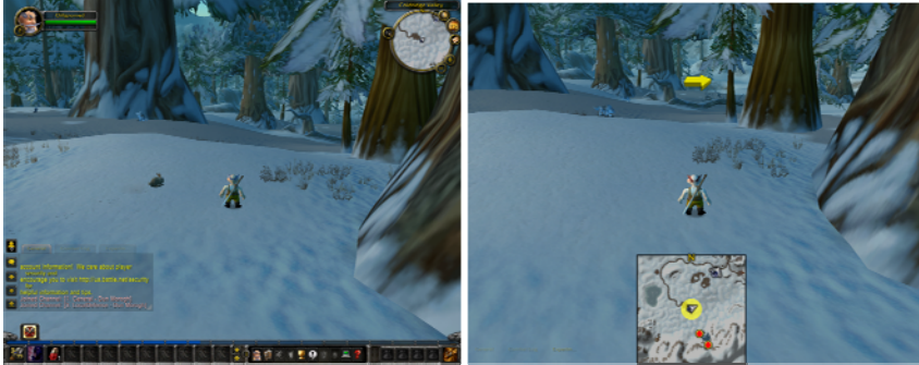
Fig. 1. The default navigation UI (left) and our enhanced navigation UI (right)

map to ensure they are moving in the correct direction. To alleviate this, in our enhanced interface, a waypoint arrow is placed above the user's avatar. Constantly updated, the waypoint arrow indicates the direction of the user's destination as the avatar moves through the environment. To improve the visibility of the user's position icon while viewing the world map, the world map size was increased by 40% and the player position icon size was increased by 100%, changes endorsed on a blog in the AbleGamers community [21]. Crosshairs were added to help focus the user's attention to their icon position (see Fig. 2).