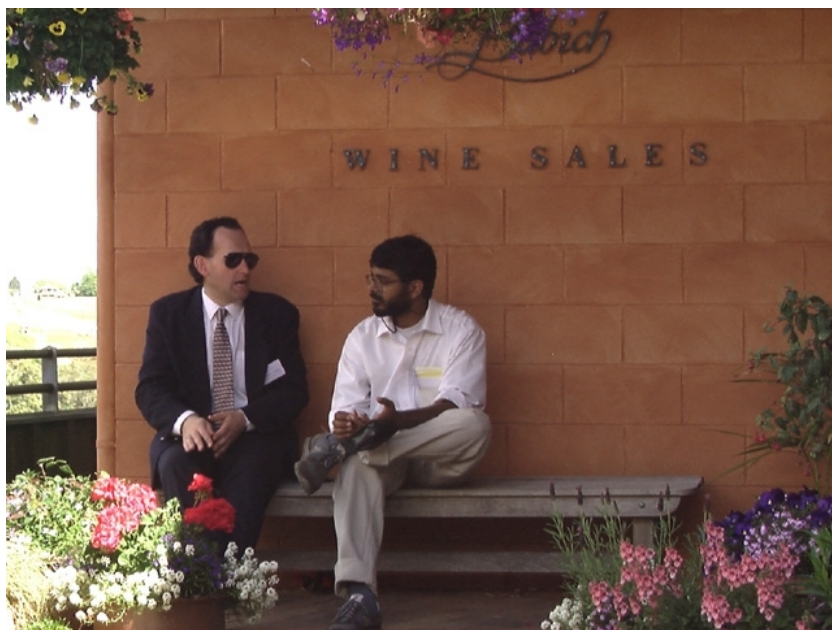
Fig. 1. converse.jpg : "Two people conversing" (from [7])

Description 2. Two people, one in a black coat and a red tie with a black eye wear, balding, fair, ... sitting on the left ... and the other in a white shirt and left