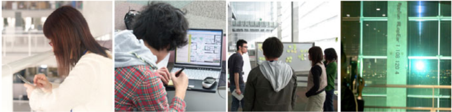
Fig. 3. Day 1: data collection, Day 2: analysis, Day 3: idea generation, Day 4 implementation

The workshop consisted of six phases, namely observation, analysis, idea generation, prototyping, implementation and use. These phases were held on different days, depicted in Fig. 3.