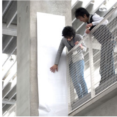
Fig. 4. Students preparing their implementation

data on spatial usage could be collected in a short time with minimum instruction. It was initially noticeable that the tweets produced by students around the space could apparently be categorized into whether they were about a static observation about the physical space, or whether students—most of whom were regular users of the campus—noticed some change in the space since a previous visit (described more fully in [14]). This is significant as it is information that could not be gained easily by an external designer, but that could prompt users to think of a possible way to redesign the space.