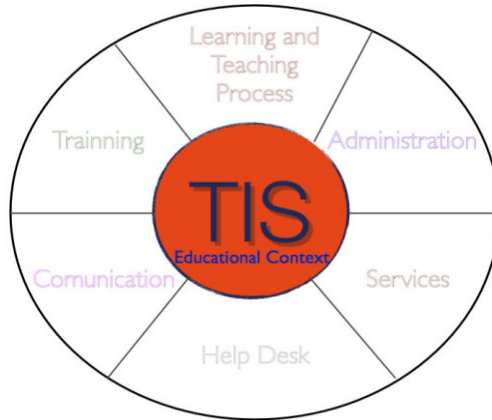
Fig. 2. Strategic orientation to the school