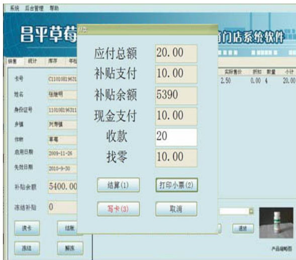
Fig. 4. Sale page of store subsystem

As a bridge between the government and farmer, the store subsystem complete the whole transaction processes. The distribute store subsystem acquires the information of the recommended agricultural materials and related subsidies information from the management subsystem and then transmit to the farmer. Store subsystem distributes subsidies to farmers as soon as they buy the agricultural materials with agricultural subsidies IC card, and then saves the detailed information for each transaction. Every store uploads the transaction data to the central database periodically to summary, aiming to query and stat. Fig 4 is the sale page of store subsystem.