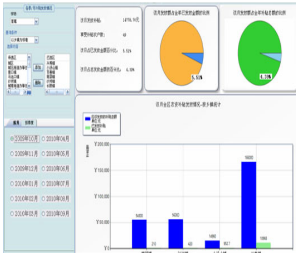
Fig. 5. Subsidy statistics by month page of the leader subsystem

Leader view subsystem provides a rich query and statistical functions. User can query the grant general progress of agricultural subsidies with the conditions of area, kind and time, the detailed circumstances of agricultural subsidies granting and agricultural products using the conditions of town, month / quarter and agricultural materials' name. All results are compared in different dimensions and displayed in graphs and tables. Analyzing these results, the management department of government can know the farmers' demand and subsidies grant progress roundly. Fig 5 is the statistics page of the leader subsystem.