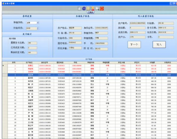
Fig. 3. Sending card page of the management subsystem