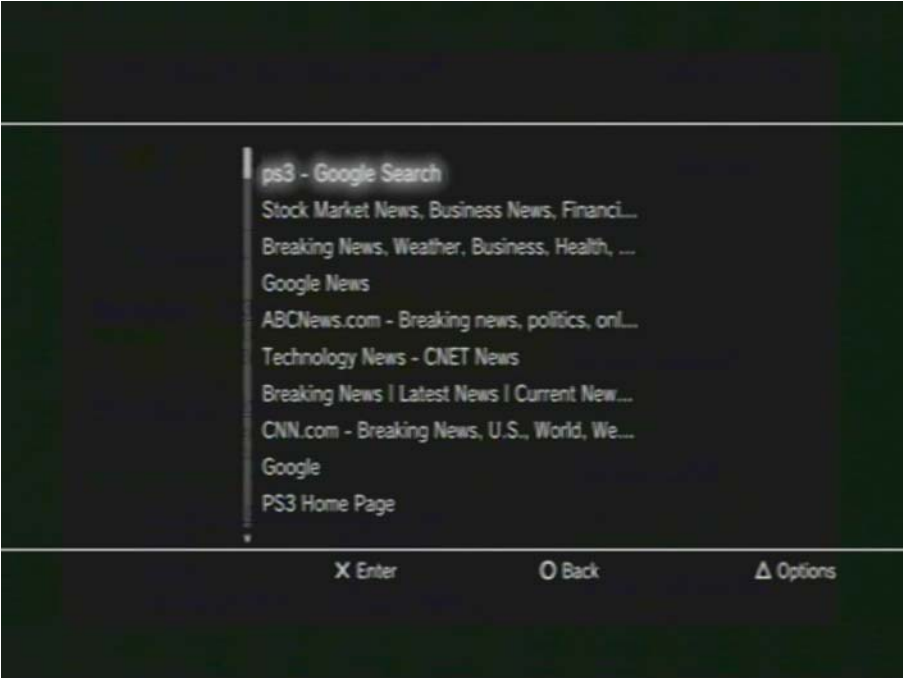
Figure 3. Browser history list.