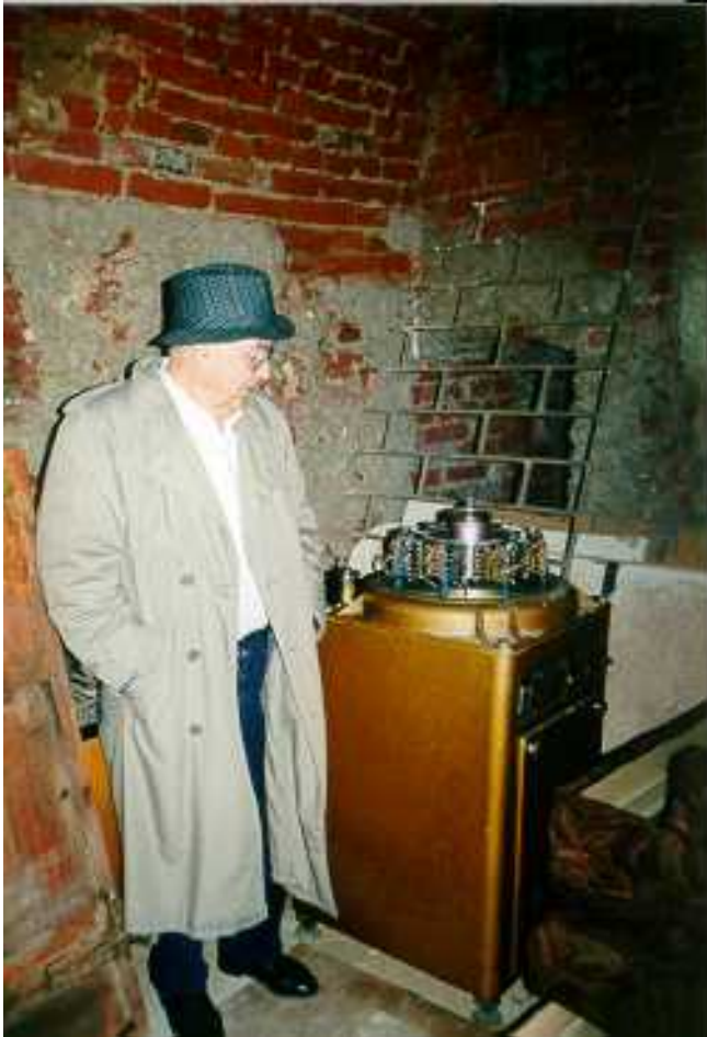
Fig. 5. I found the MECIPT-1 with our drum in a cellar of the Timisoara Fortress (2002)