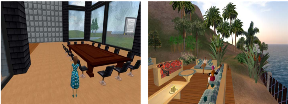
Fig. 2. (a) A meeting room; (b) An open-air meeting venue

Consider ambience and aesthetics of the learning space: Ambience and visual aesthetics are important design criteria. Aesthetic designs are perceived as easier to use and promote creative thinking and problem solving (see Figure 2(b)): “If they feel relaxed here, from visually stimulation, or aural (sound of water flowing)...then maybe they engage more with the tutorial and say more than they would in real-life in lecture hall or for something comparable with MSc usage - they are distance learners and we use discussion boards, skype, wikis, blogs, email...” [SL educator].