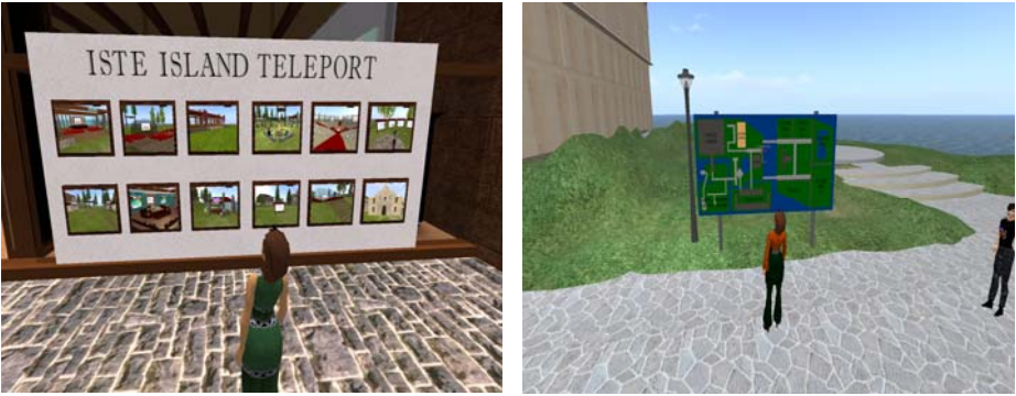
Fig. 4. (a) A teleport map; (b) map showing the various places on the island

Signs and paths help the user to navigate to their destination: “...students need certain reference points when they are entering an unfamiliar space... for example, we created definite pathways through the exhibition and some signposts and a welcome message but after that it is up to the student to explore - a few sign posts to help them ground themselves. Especially for newbies it can take a while to learn to control your avatar and I have been to spaces where I got trapped in labyrinth type buildings the only way out was to teleport” [SL educator]. Figure 5(a) shows signage which is similar to real world signage. In Figure 5(b), each path has an arch with the destination’s name at the top of the arch, thereby providing a clear route. Along with navigation to areas or buildings comes the issue of navigating within areas or buildings. Avoiding confined spaces and unnecessary objects all help the user to move freely.