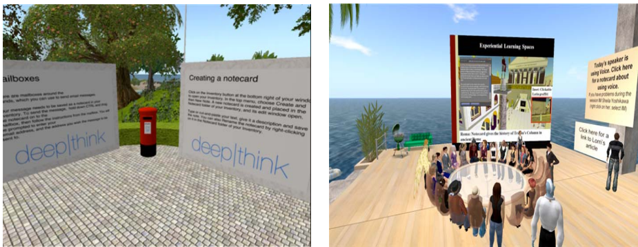
Fig. 1. (a) A drop box to collect feedback; (b) A round-table discussion

An educator discussed how the intended function should be integrated within the design: “I say one thing it needs to be very clear what the aim of the space is, ... that should not be because there is a nice sign saying what it is for but it should be in the character of the development. Something in the look and feel, the way you interact with the space is representative of its use so that it will make it easy for the user to understand” [Deep Think]. The objects in the learning spaces should imply the way in which the spaces can be used: “Well, I already mentioned chairs, although totally unnecessary [for the avatars] they do signal that a meeting is going on and certain people have committed to participating for a while” [SL educator and designer]. In Figure 1(b), chairs, a table, slide presenter, posters on the walls have been used to aid a presentation and follow-on discussions.