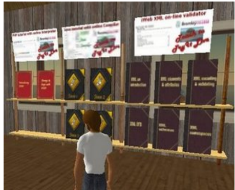
Fig. 6. (a) Room without a normal exit; (b) Metaphors for conveying the function