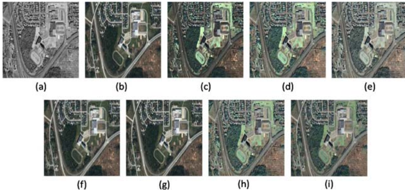
Fig. 3. Fusion Results of IKONOS2 image (a) 1m Panchromatic image (b) 4m Multispectral image (c) IHS Method (d) Modified IHS Method (e) PCA method (f) WT method (g) CT Method (h) Brovey Transform Method (i) Proposed Method