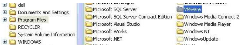
Figure 2. Program Files entries.

One of the most obvious artifacts of virtualization on a host machine is the presence of virtualization software. The two most popular systems of this genre are VMware and Parallels. Open source virtualization software systems include Qemu [2], Xen [4] and VirtualBox [13]; however, these systems are not considered in this work.