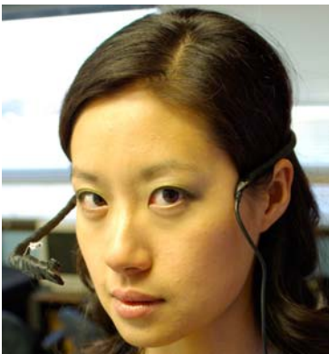
Fig. 1. The camera headpiece

Our prototype Attentive Hearing Aid (AHA) consists of a wearable infrared camera, which is pointed at the user's eye and connected to a wearable Sony U70 computer (see Figure 1). The user also wears one or two hearing aid ear piece(s), while interlocutors wear a lapel microphone that is augmented with an infrared tag (see Figure 2). These lapel mikes broadcast to a portable lapel receiver/mixer and/or induction loop system that connects to the ear piece(s) of the AHA wearer. The wearable camera is based on ViewPointer, a calibration-free eye sensor [27, 28]. The U70 processes images from this sensor and determines whether the corneal reflection of an infrared light source, in this case the tag on the lapel mike, is central to the pupil. This works as long as the camera is within 45 degrees of the visual axis of the eye. For a detailed technical discussion of ViewPointer, please refer to [27, 28]. The battery-powered IR tags on the lapel microphone (see Figure 2) consist of a bank of LEDs triggered by a microcontroller programmed with a binary code that allows tags to be identified through computer vision. When an AHA wearer is looking at another person wearing a tagged lapel microphone, AHA can thus identify the sound source and select it for amplification. Note that microphones need not be lapel microphones, but can be Bluetooth headsets commonly worn by users.