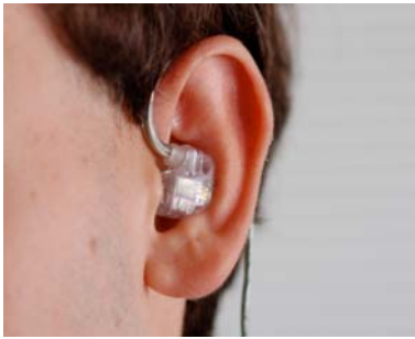
Fig. 4. Shure earpiece with foam insert

The participants knew they had selected the correct target actor when the narrative continued correctly across voices. We avoided visual selection feedback as participants would not receive such confirmation in real life scenarios either. Instead, to avoid confusion caused by subjects not recognizing the voice of an actor, in all conditions, audible switches would only take place after the correct target was selected. Thus, participants were allowed to make erroneous selections, but erroneous selection would not allow them to follow the focus conversation.