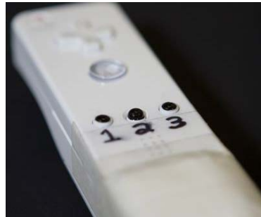
Fig. 5. Wii remote with modification and labeling