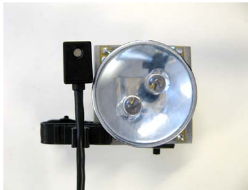
Fig. 2. Lapel mike with wireless infrared tag