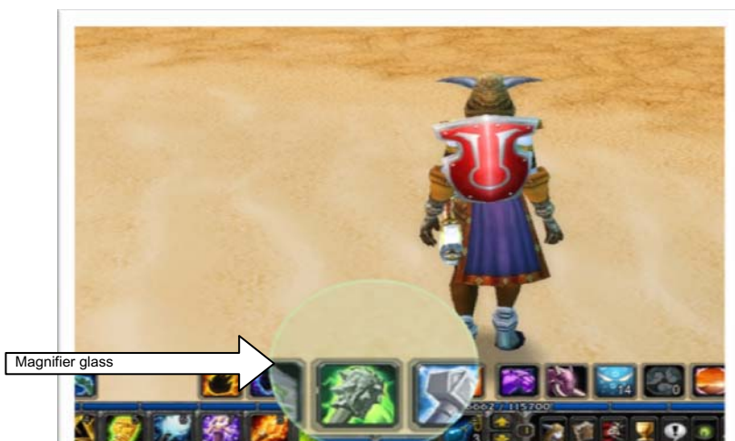
Fig. 3. The magnifier glass can be dropped by dwell to a location where a close-up manipulation is needed

the turn, regions on the right and left send the 'w' key interleaved with the turning 'a' and 'd' keys. Looking down and left (/ right) still sent just a (/ d) keys to the application, and seemed to match surprisingly well the participants' intuitive expectations. To stop locomotion, the participant glanced down to switch into 'no action' mode.