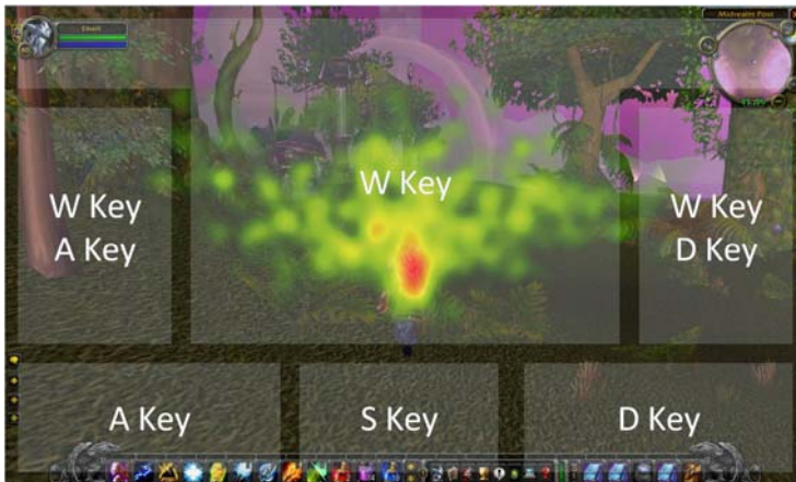
Fig. 2. Heat map illustrating the gaze behavior of a player when moving around in a part of the world in World of Warcraft that he was unfamiliar with

the turn, regions on the right and left send the 'w' key interleaved with the turning 'a' and 'd' keys. Looking down and left (/ right) still sent just a (/ d) keys to the application, and seemed to match surprisingly well the participants' intuitive expectations. To stop locomotion, the participant glanced down to switch into 'no action' mode.