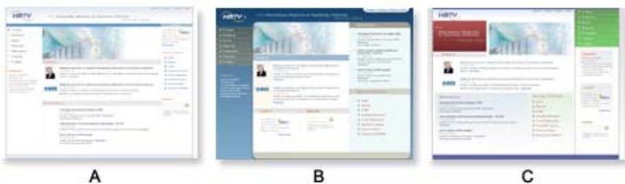
Fig. 1. University departments home page designs used in the experiment. Design A represents the high concinnity condition, B the balance condition, and C the high information .

In order to explore the usefulness of Coates theory an experiment was conducted in which the participants evaluated three alternative homepage designs of a university department’s website. Each design was prior assigned to one of the high concinnity , high information and balanced areas of the “Information – Concinnity” continuum (figure 1). In the initial phase of the study the three experimental designs were selected out of the six homepages which were identical in terms of text, images and logo but they differed in accordance to form, color, general layout and style. The homepages were designed with the intent to differ considerably in the “Information - Concinnity” scale. Given the complexity of the information and concinnity constructs we had the participants to evaluate their constituent components and then we calculated a score for each design. To that end forty four volunteer students (28 male, 16 female) of the university department in question evaluated the six homepages on Symmetry , Order , Contrast , Balance , Complexity and Novelty on a 9 point scale.