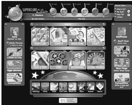
Fig. 2. The SuperclubsPLUS interface, showing the hub with the club activities and the mediator on duty

SuperClubsPLUS provides a rich environment for personalised and social learning. While the program may be implemented by a teacher as part of the school curriculum in a traditional sense, much of the interaction is informal with children (and teachers) participating in their leisure time in out of school contexts. This type of use is supported by the extended opening hours, including weekends. The children have full access to all facilities during ‘Live Time’, usually from 8.00am to 8.00pm and then ‘Build Time’ allows them to work on constructions such as articles, web pages or projects, but not communications at all other times.