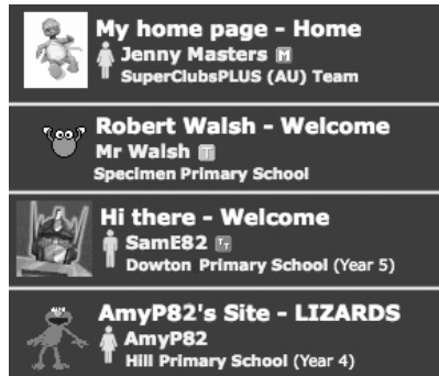
Fig. 4. Examples of the SuperclubsPLUS Profiles displayed on home pages

A teacher in SuperclubsPLUS has similar interactions with the SuperclubsPLUS tools and activities, with a notable difference in terms of communications. Teachers can email all students in their school but are not able to email children in any of the other SuperclubsPLUS schools. There are forums for teachers to talk to each other but teachers can't contribute to most of the children's clubs or forums. The only exception is the "Hotseats" forum where both children and teachers can post to the forum to ask the guest questions. A mediator is able to access all aspects of SuperclubsPLUS. They also have access to the mediator's area powered by the ICE Engine where email monitoring, image uploads and other mediating tasks are performed.