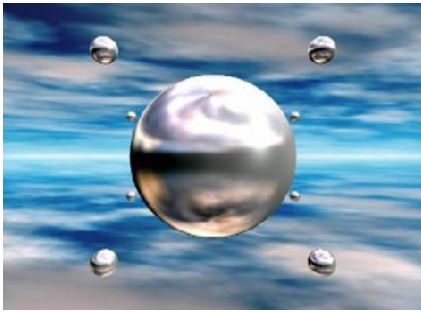
Fig. 1. A scene in the movie [23]

Ten healthy subjects ( 23.6 \pm 2.2 year) voluntarily participated in the study. All of them were Japanese and lived in Nagoya and its surroundings. The subjects gave their informed consent prior to participation. The following were the exclusion criteria for subjects: subjects working the night shift, subjects with dependence on alcohol, subjects who consumed alcohol and caffeine-containing beverages after waking up and less than two hours after meals, and subjects who may have had any otorhinolaryngologic or neurological disease in the past (except for conductive hearing impairment, which is commonly found in the elderly). In addition, the subjects must not have been using any prescribed drugs.