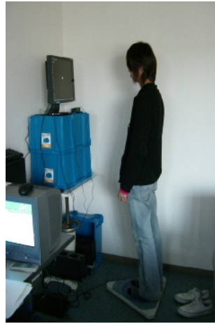
Fig. 2. The setup of the experiment [23]

We ensured that the body sway was not affected by environmental conditions. Using an air conditioner, we adjusted the temperature to 25\text{ }^{\circ}\text{C} in the exercise room, which was kept dark. All subjects were tested from 10 am to 5 pm in the room. The subjects were positioned facing an LCD monitor (S1911- SABK, NANA O Co., Ltd.) on which three kinds of images were presented in no particular order (Fig. 1): (I) a visual target (circle) whose diameter was 3 cm; (II) a new 3D movie that shows a sphere approaching and going away from subjects irregularly; and (III) a conventional 3D movie that shows the same sphere motion as in (II). The new stereoscopic images (II) were constructed by Olympus Power 3D method. The distance between the wall and the subjects was 57 cm (Fig. 2).