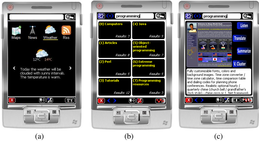
Fig. 2. (a) VipAccess Mobile interface. (b) VipAccess Mobile with clusters. (c) VipAccess Mobile for summarization.

In terms of summarization of web contents, accessing summaries of information instead of full information may be a great asset for users of mobile devices. Indeed, most web pages are designed to be viewed on desktop displays. As a consequence, users may find it hard to evaluate the importance of a document as they have to come through all of it by repetitive zooming and scrolling. Some solutions have been proposed by content providers to overcome these drawbacks. They usually require an alternate trimmed-down version of documents prepared beforehand or the definition of specific formatting styles. However, this situation is undesirable as it involves an increased effort in creating and maintaining alternate versions of a web site. Within the VipAccess project, we propose to automatically identify the text content of any web page and summarize it in an efficient way so that web browsing is limited to its minimum. For that purpose, we propose a new architecture for summarizing Semantic Textual Units [3] based on efficient algorithms for semantic treatment such as the SENTA multiword extractor [4] which allows real-time processing and language-independent analysis of web pages thus proposing quality content extraction and visualization (Figure 2c).