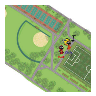
Fig. 2. A 2D virtual world view appearing on a mobile phone display, extracted from our SoundPark prototype. Shown are two player avatars, a sound loop virtual object indicated by the musical note, and a player (Zack), approximately in the middle of the goal line of the football field (anchored at his feet). The yellow circle represents the staging area.

uGASP, in addition to being a key part of the SoundPark architecture, provides a bundle for deploying a client side game engine. A 2D map display on mobile phones extracted from our SoundPark prototype illustrated by Figure 2, is used to show the locations of other players and virtual objects. In this application, the deployed byte-code contains only the necessary bundles, providing an optimized application memory footprint, as required for deployment on the resource constrained device.