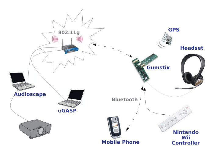
Fig. 4. SoundPark devices overview. Note that several of the components are unique to particular player roles (e.g., mobile phone for scouts, and Wii controller for hunters).

services added to the architecture are reusable for future application implementation. While this significantly reduced the necessary effort during application design and deployment, many issues remain. In this section, we discuss various related aspects of our experience: the use of mobile devices for the user interface, difficulties encountered during physical world modeling, integration, control and monitoring of the software components, and scalability.