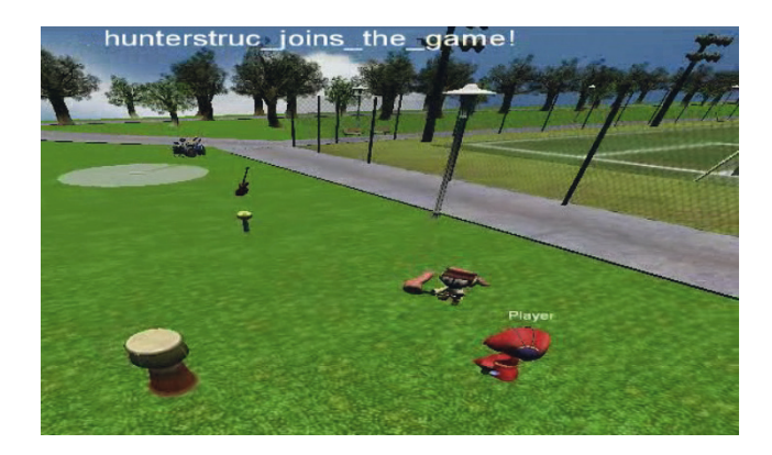
Fig. 3. 3D virtual world view, in which two players, the hunter and scout, can be seen. Sounds are spread over the field.

In their current version, the Audioscape 3D audio and graphical engines are integrated into Pure Data (PD) [17], a pseudo real-time environment dedicated to (simulatenously) programming and executing interactive multimedia applications. The PD internal design provides an interface allowing the development of additional processing components, called externals . At the client side in our architecture, our PD externals are executed by Pure Data anywhere (PDa) [18], a rewritten fixed-point version of PD.