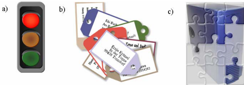
Fig. 2. Different solutions for the “Progress Bar” to display the task status: a) as traffic light, b) as card stack c) as a puzzle

A specialized “High Score List” is an “Anonymous Ranking”. Normally, in high score lists, names mark the presented information. This could cause some group effects or discouraging effects, so in some applications, names should not be mentioned. The idea of this pattern can be specialized in a personal ranking – a personal orientation from which the user gets information about his personal performance data related to an average value or related to personal or group-wide best marks.