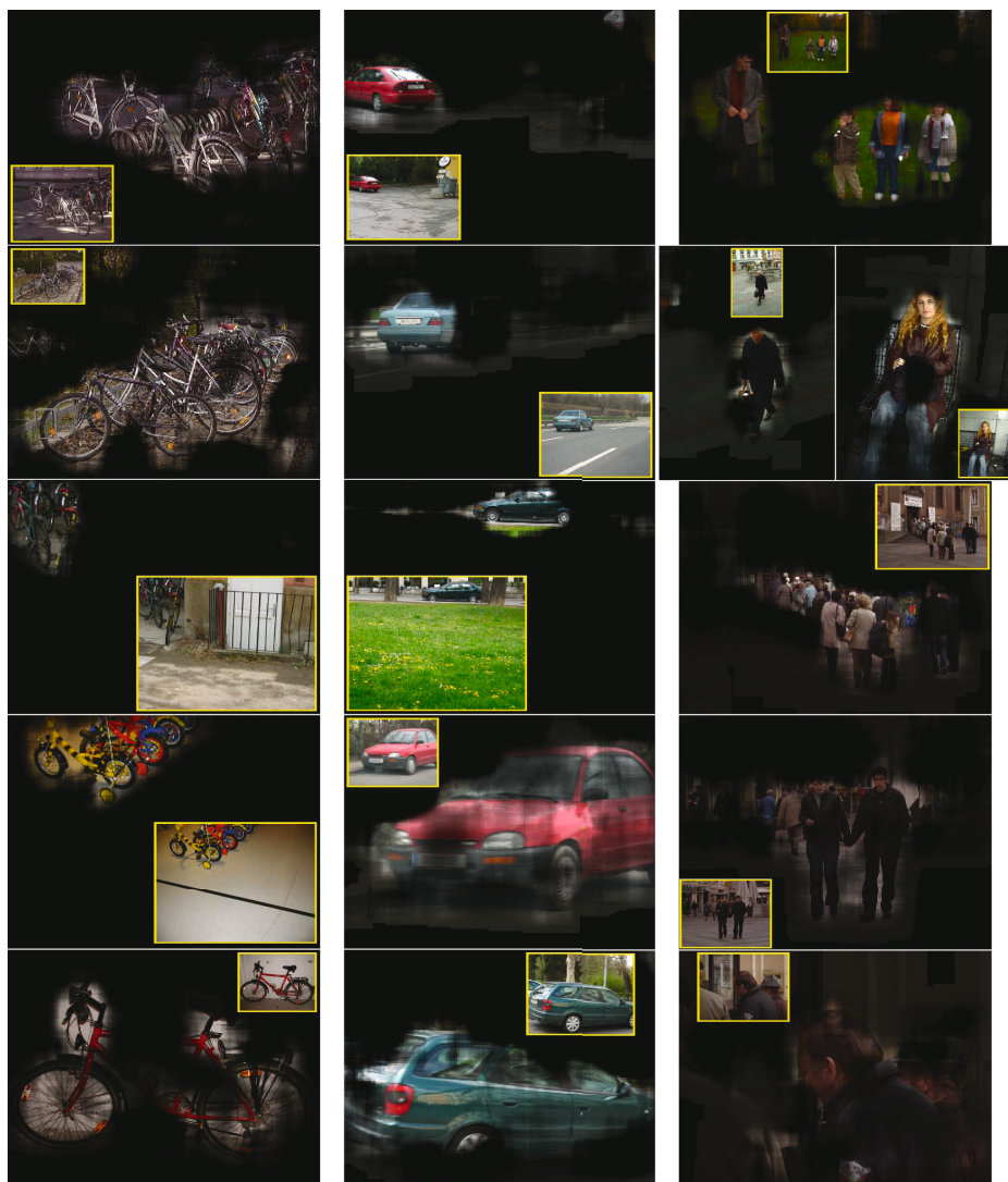
Fig. 4. Selected results on Graz-02. (Best viewed in color). Images are first masked by the classification then transformed to HSV. The HSV images have their V channel weighted by the confidence in the classification, darkening the pixels which are less confident about the class. All images shown were generated with the parameter set denoted AIB200RGB and classified with an SVM.