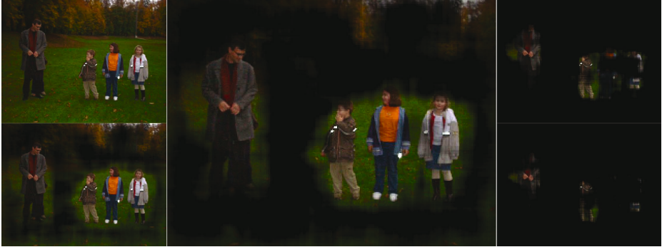
Fig. 1. Upper Left: Original image. Middle: Labeling weighted by the confidence for the class "person". Lower Left: Labeling weighted by the confidence, with low confidence background pixels reclassified as foreground. Right: Labeling weighted by the confidence, with low confidence foreground pixels reclassified as background.

performs better than the state of the art [4] on a challenging dataset [5] despite its simplicity.