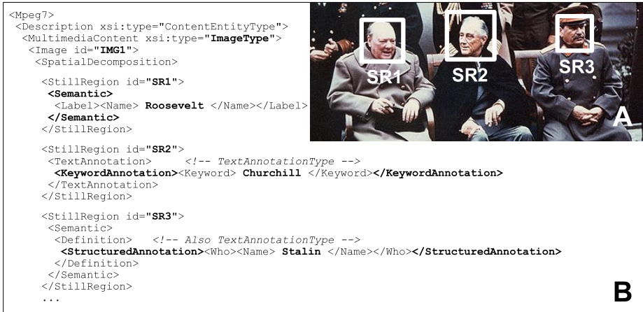
Fig. 1. MPEG-7 annotation example

document. Actually, for almost all other media types, the semantics of the fragment identifier has not been defined or is not commonly accepted. Providing an agreed upon way to localize sub-parts of multimedia objects (e.g. sub-regions of images, temporal sequences of videos or tracking moving objects in space and in time) is fundamental 3 [4]. For images, one can use either MPEG-7 or SVG snippet code to define the bounding box coordinates of specific regions. For temporal location, one can use MPEG-7 code or the TemporalURI RFC 4 . MPEG-21 specifies a normative syntax to be used in URIs for addressing parts of any resource but whose media type is restricted to MPEG [5]. The MPEG-7 approach requires an indirection: an annotation is about a fragment of a XML document that refers to a multimedia document, whereas the MPEG-21 approach does not have this limitation.