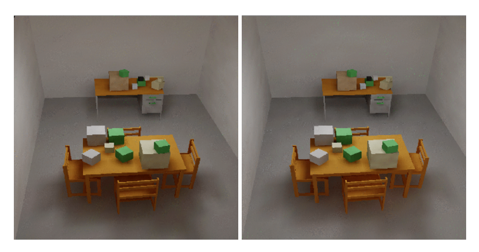
Fig. 3. (left) Frame 17 without reusing paths. 600.000 paths. Time= 70 sec. (right) Frame 17 reusing shooting and gathering paths. 600.000 paths. Time= 11.7 sec. MSE is a bit higher in the second image. Speed-up factor about 4.4

involves reuse of the gathering paths, but not of the shooting ones. Each shooting has spent about 114 sec., and the combined gathering has spent about 86 sec. This is a total of 114 \times 30 + 86 = 3506 sec. = 58.5 min. Animation 3 has been obtained by reusing both shooting and gathering paths. The combined shooting