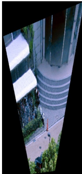
Manhole on road