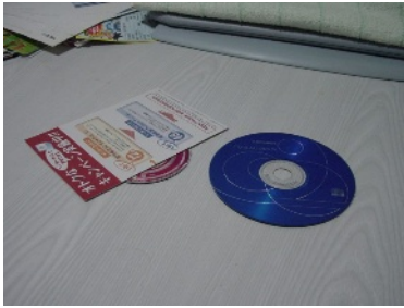
Table scene 2