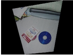
Table scene 2