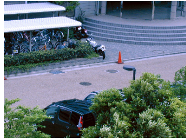
Manhole on road