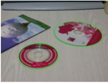
Table scene 1