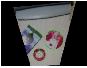
Table scene 1