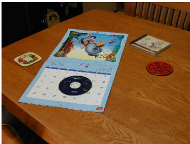
Table scene 3