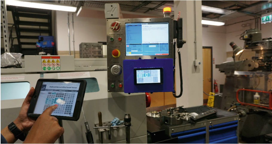
Fig. 3. Remote maintenance interface mounted on a HAAS control panel.