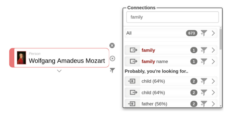
Fig. 1. Searching properties related to "family" of entity Wolfgang Amadeus Mozart

The demo application can be found at: http://wikidata.metaphacts.com. The basic QA process is exemplified by the following simple scenario: