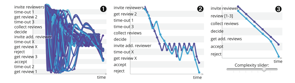
Fig. 1. Three possible ways to display the handling of reviews for a journal from [1] on a CJM: 0 projecting the actual journeys (only the first 100 – out of 10,000 – journeys are displayed); 2 using two representative journeys; and, 3 using two representative journeys and abstracting the activities using the technique presented in this paper.