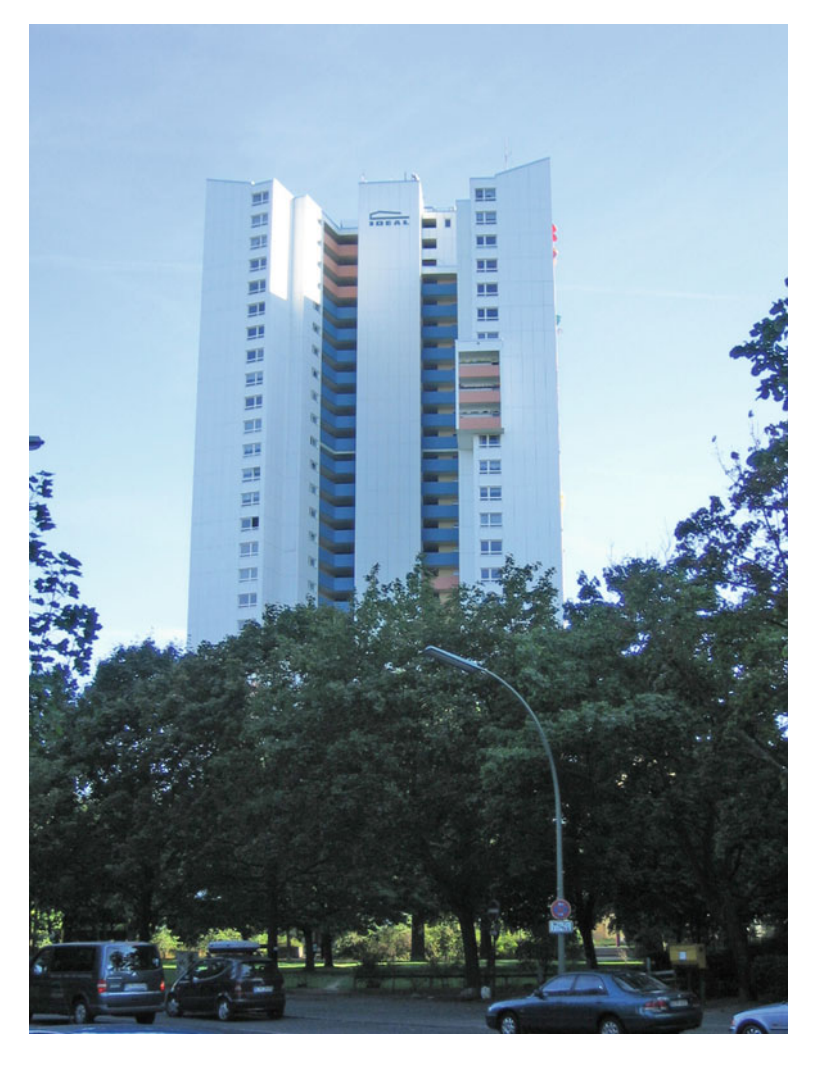
Fig. 5.5 The 'Ideal Tower' (1966–1969, Walter Gropius/Alexander Svianovic), commissioned by the Ideal Construction Cooperative in the Gropiusstadt estate in West Berlin.

average of 14.4%—again, referring to slightly different areas (SenStadt 2015, data for district region 'Gropiusstadt').