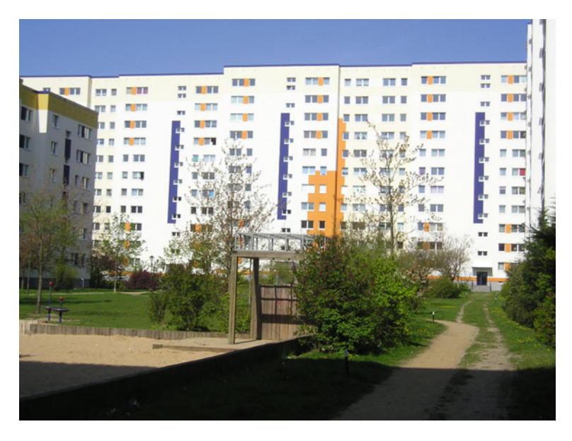
Fig. 5.7 A large courtyard in Marzahn built in the 1970s; renovated and fitted with insulation and colourful facades in the 1990s.

immigrant ghettos, and immigrant presence still concentrates on the inner-city neighbourhoods that were considered unattractive in the 1960s when the first wave of immigrants arrived.