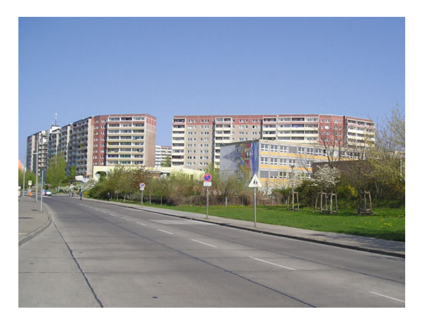
Fig. 5.6 Buildings in Marzahn, built late-1970s.

elderly, and those who come increasingly belong to the lower classes. The areas are nevertheless not exclusively inhabited by the marginalised. In 2002, the unemployment rate (of Germans) reached 17.1% in Marzahn and 15.4 in Hellersdorf; certainly very high, but not so far above the Berlin average of 14.2% (SenStadt 2004).