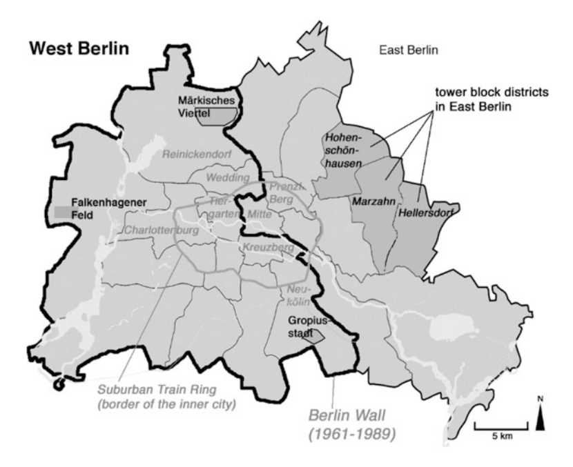
Fig. 5.1 Berlin's large estates.

(Institut für Markt und Medienforschung 1986). At the time, the Märkisches Viertel was a modest neighbourhood with social challenges, but by no means the 'grey hell' as which it had been depicted 20 years earlier (Figs. 5.1 and 5.2).