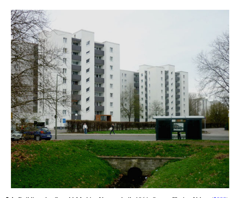
Fig. 5.4 Buildings by Oswald Mathias Ungers, built 1964.