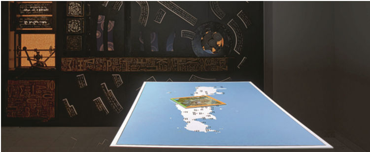
Fig. 4. Paper view at “Heraklion info-point“

can concurrently use the table [7]. When a user places a cardboard piece over the table surface, an image is projected on it, adding details to the surface image. Furthermore, a pointer (i.e., a magnifying glass) is projected on the paper's centre, which assists the user in exploring the surface, guiding her/him to the information hotspots available. When a hotspot is selected, a multimedia slideshow starts. The slideshow comprises a series of pages, each of which may contain any combination of text, images, and videos. At the bottom area of the slideshow, a toolbar is projected containing an indication of the current page and the total number of pages available, as well as buttons for moving to the next/previous page (Fig. 4).