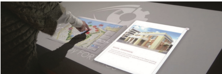
Fig. 5. Interactive documents at the “Heraklion info-point“

The interactive documents system augments printed documents that are placed upon a surface (e.g., a plain table) with multimedia content and interactive applications. Such content is dynamically displayed in augmentation to the currently open page of the document, and is aligned in real-time with its 2D orientation upon the table surface. At the Heraklion Info Point visitors may interact with the printed map of the historical centre of Heraklion which is freely distributed. The system electronically augments the printed map with multimedia information in several languages and the user is able to interact through touch with the map in order to extract further information (Fig. 5).