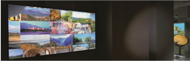
Fig. 6. Media gallery at the “Heraklion info-point“

Media Gallery is a system that allows browsing and exploring large collections of multimedia information using touchless remote interaction, by employing computer vision technologies. At the info point this system is targeted to attract the attention of visitors to a collage of landscapes, people, animals and plants of the island (Fig. 6).