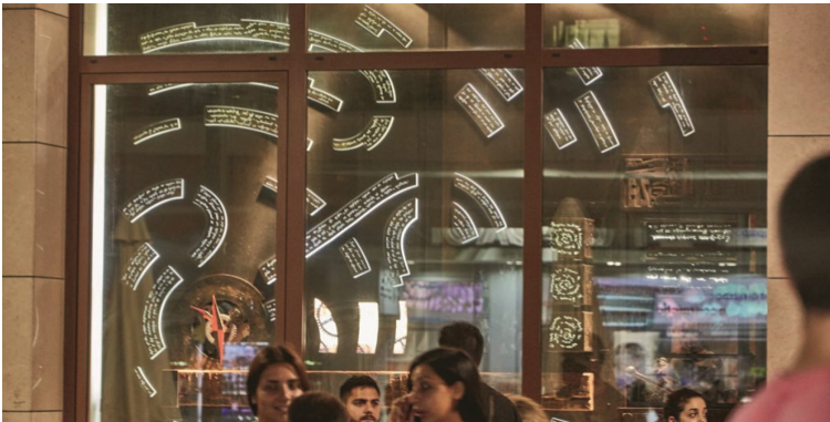
Fig. 1. Interactive sculpture inspired by the history of the city of Heraklion

There is one more system, which presents a synthesis of technology with art not only inside the info-point, but also at the window to the historic pedestrian way in front of the building. This is an interactive sculpture, where innovative technologies are combined with visual arts. Set in the main window, it draws inspiration from the myth of the Labyrinth, works of Nikos Kazantzakis and other elements of Crete's long cultural tradition to form a complex double-sided relief that welcomes visitors to explore it by touch. Visitors are invited to touch the mechanical devices embedded in the sculpture so as to reveal the scripture and set the ancient device back to life (see Fig. 1).