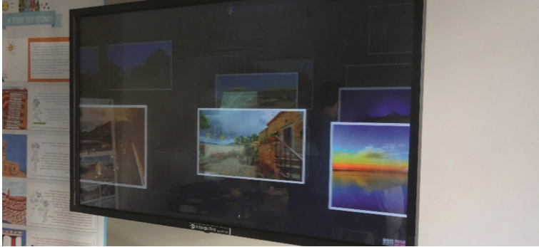
Fig. 2. Infocloud “Heraklion info-point“

which may contain an image or video accompanied by a short textual description. The keywords, images and video thumbnails constantly flow (e.g., from right to left), while (optionally) the background flows to the opposite direction. Items are positioned at multiple layers, each of which has different attributes (size, speed, dimness) (Fig. 2).