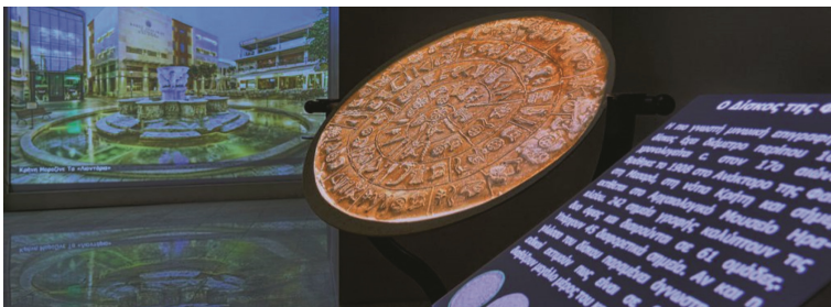
Fig. 7. Stater 360 2 at “Heraklion info-point“

Stater 360 2 comprises a revolving disk which seems made of clay and on this surface different views of the Phaistos Disk are projected. Visitors may turn the disk over in order to see both sides, while they can find out information about this legendary discovery of Minoan archaeology by touching the surface. The available information includes details of the Disk’s discovery and a brief presentation of the latest findings of hieroglyphics, as well as attempts at understanding what the mysterious writing is about (Fig. 7).