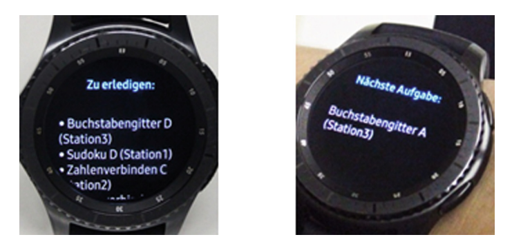
Fig. 1. List of tasks displayed on smartwatch (left, "To do: crossword puzzle D (station 3)...") or next task displayed on a smartwatch (right, "Next task: crossword puzzle A, (station 3)").

Within each condition, six tasks (each task twice) were processed. At the end of each condition, participants filled out the UEQ [18]. After all four conditions, they answered the demographic questionnaire. In the end, the participants could rate their favorite condition. In sum, the experiment lasted from 60 to 80 min.