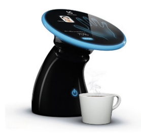
Fig. 4. Coffee pot uses palm-print recognition