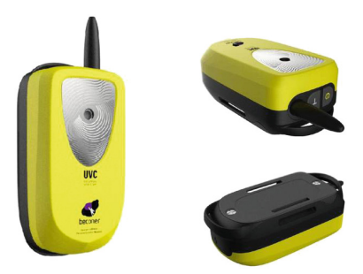
Fig. 3. "Beconer" UVC PLB

Viewed from a general survey, "cross-border" prevalent in the design community makes the boundary between different fields of design increasingly obscure. Many new