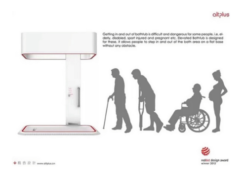
Fig. 6. Elevated Bathtub