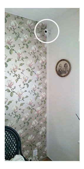
Fig. 1. Camera in a bedroom

"remote monitoring is based on a decision for assistance in the same way as home-help services" meaning that people interested in getting access to the service associated with the night camera have to apply online or call the assistance officer. The municipality contacts the applicants, and it is then the care officer who assesses and decides upon the case. If the night camera can be ordered, the users have to give their home keys to the municipal personnel.