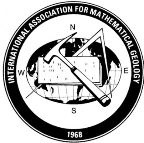
Fig. 36.2 Official logo of IAMG