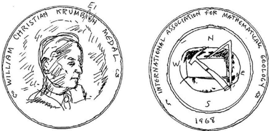
Fig. 36.3 Design for Krumbein medal

committee (chaired by the President) selects the William Christian Krumbein medallist and another special committee selects the Best Paper for an award.