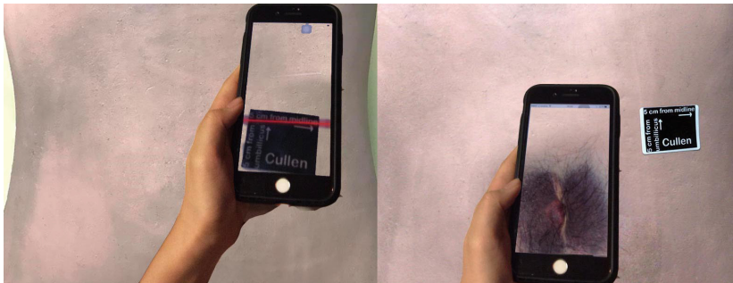
Fig. 1. Using CAROPE: Left: marker/trigger (black box) is scanned (red line). Right: Cullen’s sign appears as an AR visual overlay on abdomen of a mannequin. (Color figure online)

These markers are printed on stickers and adhered onto designated areas of the body to display these signs when scanned. Some are printed with information as to where and how it should be placed in relation to landmarks such as the umbilicus (belly button). For example, when the skin surrounding the umbilicus is augmented to display a bruise over it, the student can now describe it in detail during ‘Inspection’ and would be expected to perform ‘Palpation’ with care (Fig. 1).