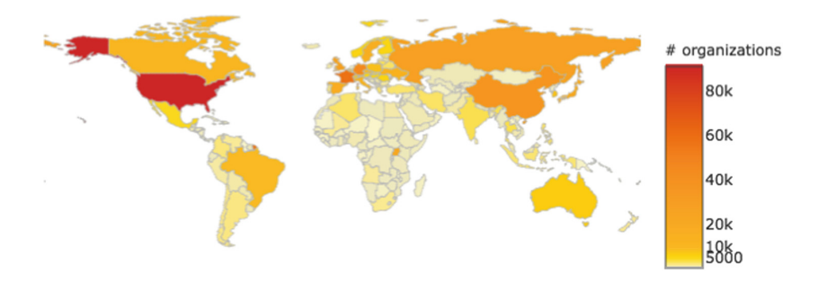
Fig. 3. Heatmap of organization frequency by country