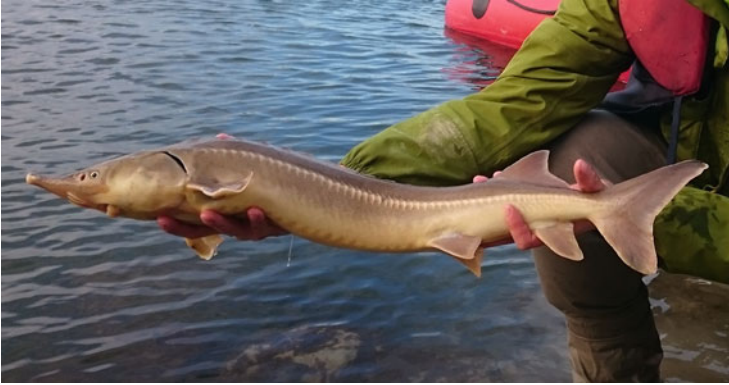
Fig. 26.1 A sterlet ( Acipenser ruthenus ), a pure freshwater sturgeon species, native in the Pontocaspian region. Sturgeons are unique with regard to external appearance and their traits

adults need a wide selection of habitats within the river and have to have the ability to migrate downstream after spawning.