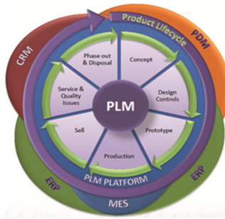
Fig. 1. PLM defining elements

The management path of PD within PLM addresses the general product engineering process from the creation of a product idea to its delivery consisting of dedicated phases, incorporating workflows and link components to each other providing a complete picture of the product definition. Typical phases of the PD process within PLM is defined in the table below (Table 1).