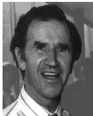
Fig. 13.2 Richard Skemp, second PME president

without real examples. We assume that the lack of a written space (six pages per a contribution) is also a reason for this style of representing findings. At any case it leaves the impression that for these researchers theoretical ideas are much more important than the findings or their interpretations. Also if empirical findings appear, they mostly emphasize the end-products and less the observation and analysis of the learning processes.