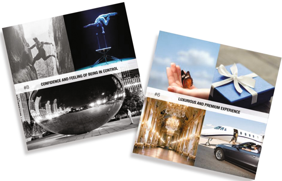
Fig. 1. Examples of the context cards: on the left, the card of confidence and feeling of being in control and on the right, the card of luxurious and premium experience.

In order to better understand the bus passengers needs and expectations, and to ideate services, we conducted three co-design workshops. In co-design, users are invited to participate to the design activities together with design professionals in a continuous cooperative process that results in better solutions for daily life [22, 23]. In co-design, users are treated like experts, but since they often have very little experience on innovation it is important to provide materials that support the ideation activities [22]. The co-design materials, such as workshop tools can provide different entry points to the design problem as well as help the participants to build their own design language [13]. These co-design methods suit best for the early phases of the design process, e.g. for idea generation through brainstorming new ideas, or when rethinking existing solutions [13].