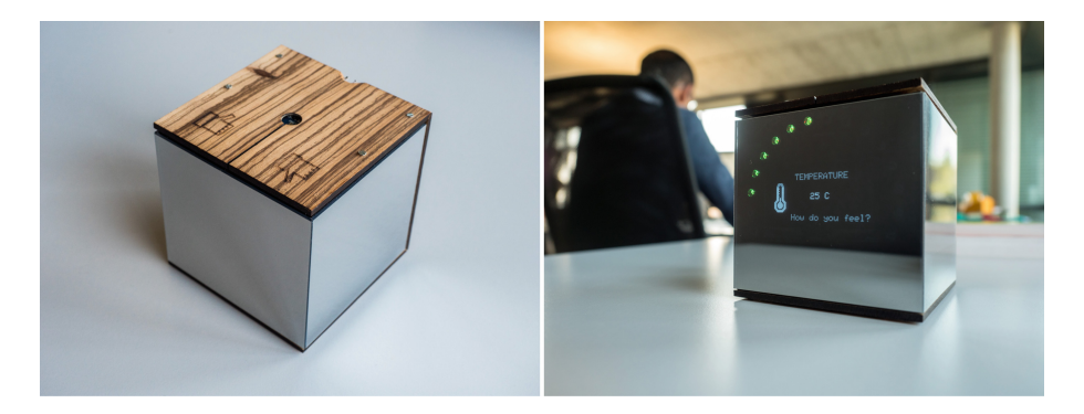
Fig. 2. ComfortBox is an interactive research tool designed to facilitate data collection in lab and in-situ comfort studies. The physical design is intended to help blend into the desktop setting and stay in the periphery of attention when not used.

API for Researchers. A programming interface based on Node-RED<sup>7</sup> is provided. The experimenter designs a user scenario which determines the opportune circumstances under which a specific question can be asked, and particular information to be provided to the user.ComfortBox is currently being used by the