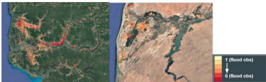
Fig. 1 Number of times an area (pixel) flooded from 2003–2015 in Senegal using the DFO algorithm at 250 m per pixel resolution ( left : Ziguinchor, Senegal; right : Saint-Louis, Senegal and Senegal River)

Machine learning hydrology: Using the inventory of past floods as training data, a machine learning model was developed in Google Earth Engine to predict which parts of the country and population are at risk from future extreme flood for five priority watersheds. The floodplains cover 34% of the country. The Saint-Louis region, in the Senegal River Valley, was the primary testing ground for customizing the algorithm, where the authors designed and assessed four machine learning approaches on 11 flood conditioning factors. The model's high accuracy