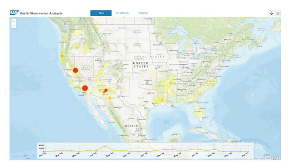
Fig. 1 Historical fire events in the USA

Importantly, experts then also have the chance to learn from historical information. They need to understand: what are the characteristics of large fire events, what