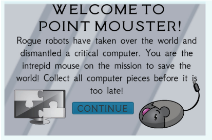
(a) Storyline of game