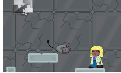
(b) Playing game