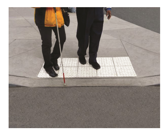
Fig. 1. Detectable warnings as commonly installed on a wheelchair ramp.