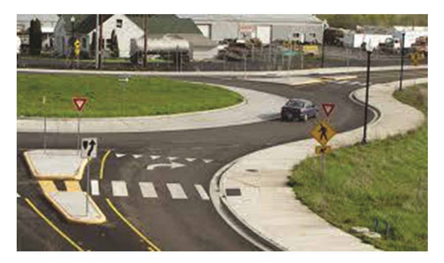
Fig. 3. A roundabout showing curved sidewalks and roadways with crossing facilities

One of the latest developments in the built environment that is impacting the independent travel of pedestrians who are blind is the use of more complex intersection geometries. From the 1990s to the 2000s, this issue was focused on the increased building of roundabout intersections. Roundabouts present a particular problem to people who are blind because traffic does not have to stop and because walking paths