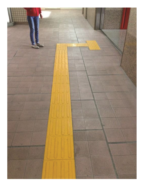
Fig. 2. Surface treatments used to guide pedestrians

When a pedestrian who is blind is at a legal crossing place, the traditional cue for determining when to begin crossing is the surge of traffic moving parallel with the pedestrian's intended line of travel. However, if no traffic is available, if the environment is noisy, or if the pedestrian has a problem perceiving the traffic, this cue might not be available. The solution for this issue of accessibility is the provision of accessible pedestrian signals (APS) [19]. This solution provides a pushbutton on each corner of an intersection that a pedestrian pushes when they wish to cross a street. At the appropriate time in the traffic cycle, which would be when the visual walk signal is lit for that pedestrian,