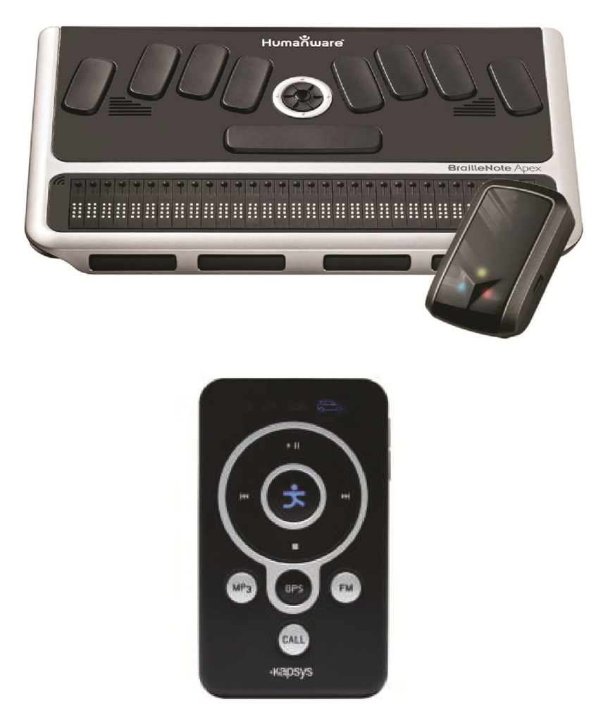
Fig. 5. Images of the Braillenote GPS from Humanware and the Kapten from Kapsys

chosen to work with the Department of Transportation to further their ideas included Austin, Columbus, Denver, Kansas City, Pittsburgh, Portland, and San Francisco. In most cases, the proposed systems involve increased access to people with disabilities, with several specifically addressing needs of people with visual impairments. By ensuring that all city inhabitants have easy access to and use of the proposed systems, a city stands a better chance of developing a system that will be accepted and effective.