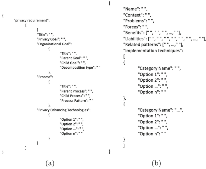
Fig. 2. PriS and Privacy Process Pattern JSON template

pattern will be included in the general template of the PriS JSON template to enhance the Process Pattern attribute.