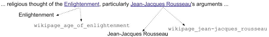
Fig. 1. Illustration of mention-entity decomposition in the EAT model

To obtain \mathbf{w} and \mathbf{e} in the same space, we introduce the concept of Extended Anchor Text (EAT). Through this, we combine entity information with its anchor text, and consequently introduce it into the corpus. To obtain EATs, the mention of an anchor text a_i is redefined as a'_{ij} = (w'_i, e_j) where w'_i = w_i if w_i is not empty, otherwise w'_i is equal to the set of words present in e_j . For an illustration of the decomposition into anchor text and entity, see Fig. 1. We redefine a corpus like a sequence of EATs a' , so the full vocabulary is defined by \mathbb{F} = \{V \cup \xi\} , that is, the set of embeddings to be learned now contains both words (including mentions) and entities from the knowledge base.